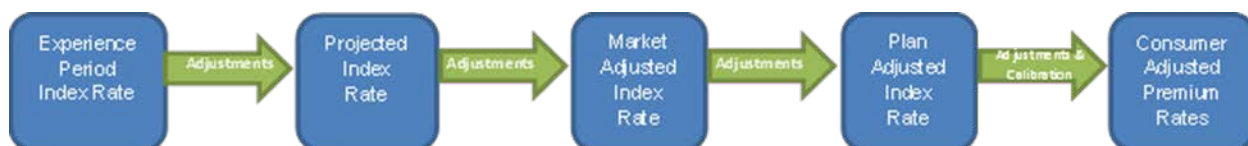
Figure 1 Flow of the Index Rate development process

The following graphic depicts the flow of the Index Rate development process: